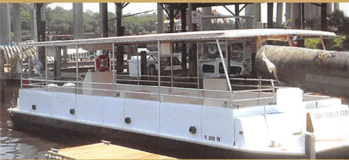
50-PASSENGER OPEN-AIR BOAT