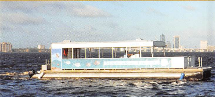
60-PASSENGER OPEN-AIR BOAT