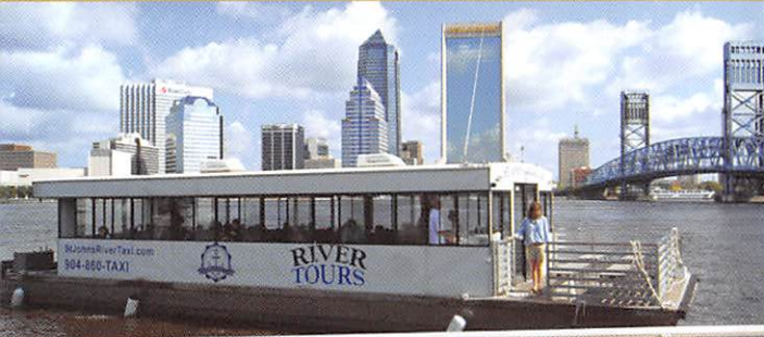
100-PASSENGER ENCLOSED BOAT - ST. JOHNS EXPLORER