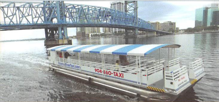
100-PASSENGER OPEN-AIR BOAT - MISS HADLEY